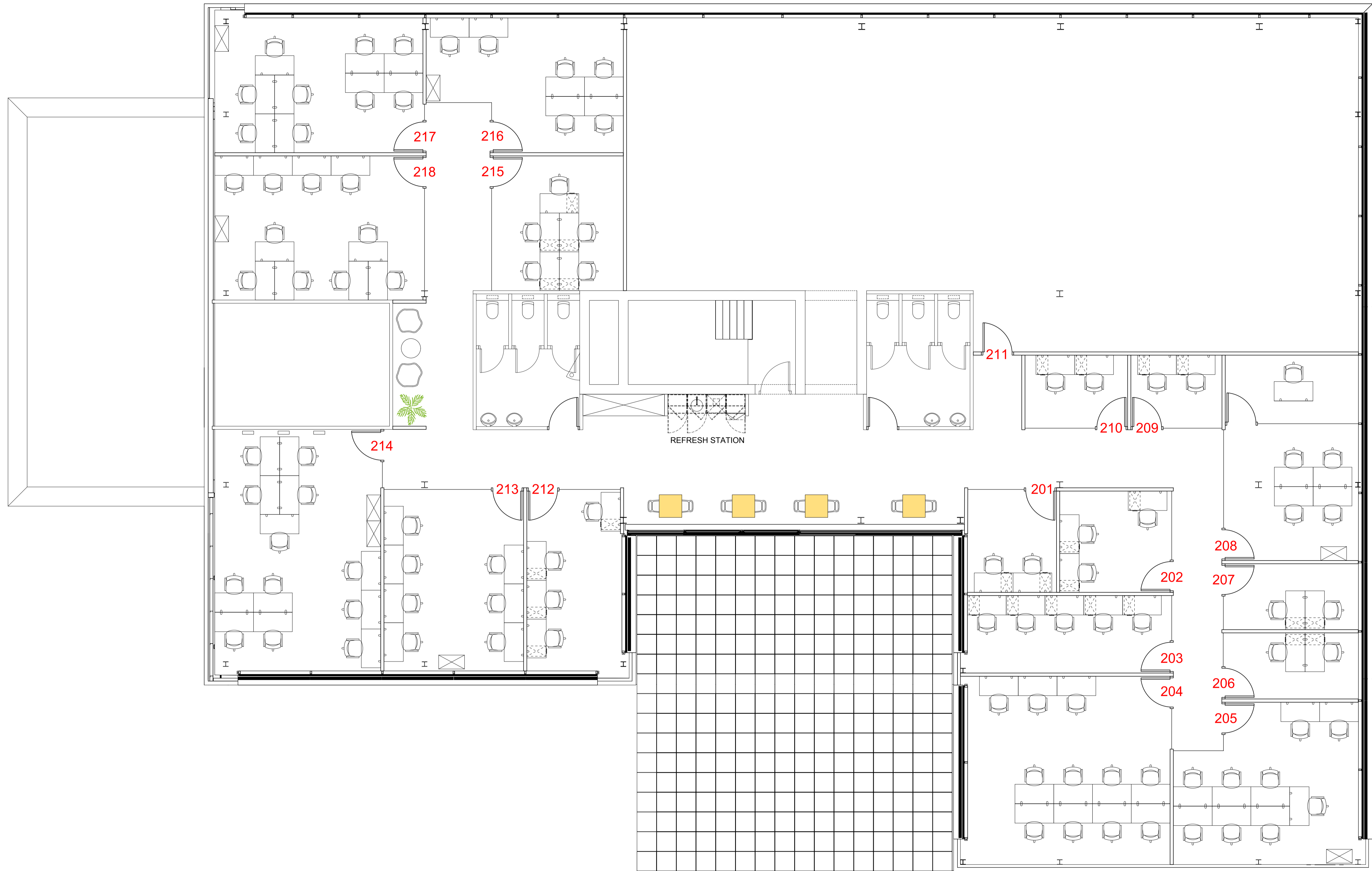
2ND LEVEL FLOOR PLAN